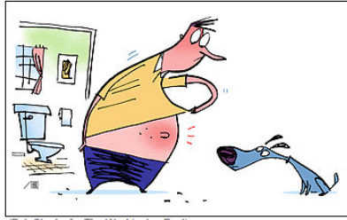
(Bob Staake for The Washington Post)

No fair just going to the Internet and copying out the mountains of advice offered up by well-meaning and totally misinformed commenters who habituate medical Web sites.